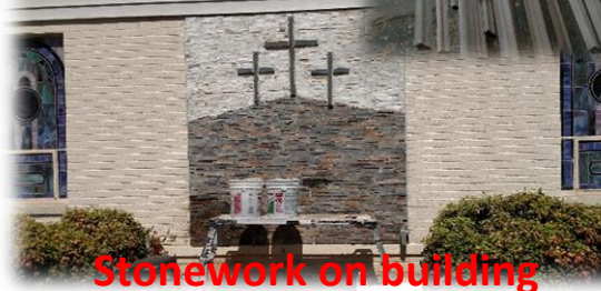
Stonework on building