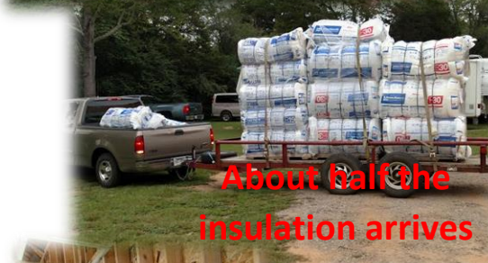
About half the insulation arrives