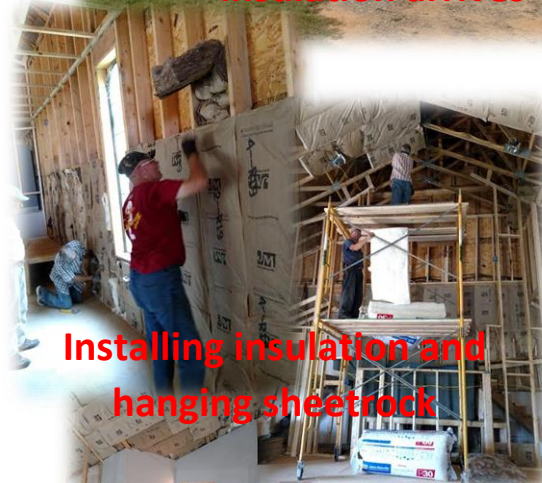
Installing insulation and hanging sheetrock