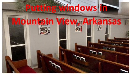
Putting windows in Mountain View, Arkansas