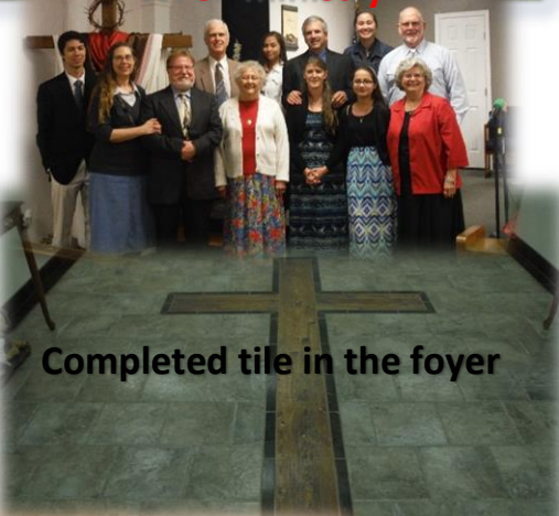
Completed tile in the foyer