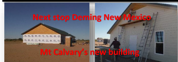
Mt Calvary's new building